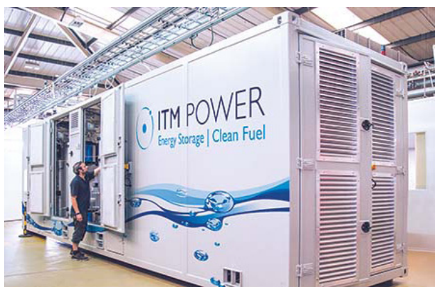
Modular electrolyser unit.

Earlier this year, Europe's largest PEM electrolyser was installed at Shell's Energy and Chemicals Park Rheinland, near Cologne, Germany. The electrolyser can produce up to 1,300 tonnes of green hydrogen a year, which will initially be used to produce fuels with lower carbon intensity.